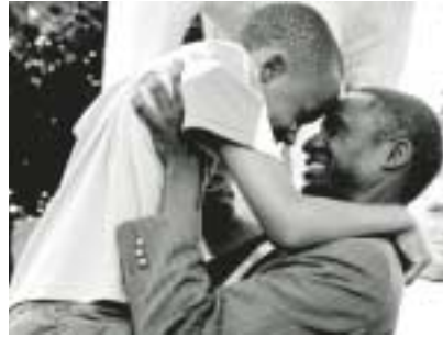
„Hop“, directed by Dominique Standaert, Belgium 2002

Also the Belgium production „Hop“, an impressive migrants' drama told from the view of a boy, has been sold to eight countries up until now, not only in Europe, but to the USA and Canada as well.