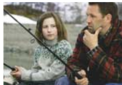
„Immediate Boarding“, directed by Ella Lemhagen, Sweden/Norway 2003