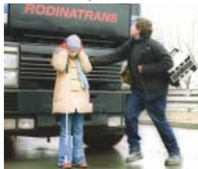
„The Blindgaenger“, directed by Bernd Sahling, Germany 2003