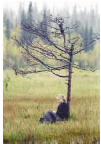
„Elina - As If I was Not There“, directed by Klaus Härö, Sweden/Finland 2002

„The Living Forest“ made more than 500.000 admissions in Spain, 70.000 in Belgium (!) and 22.000 in the Netherlands. This film is also suitable for a very young audience and therefore has high potential for other countries, too. Another film from Spain, with 1 mio. admissions a great domestic success, will enter the festival season this year: that is „Planta 4“ by Antonio Mercero.