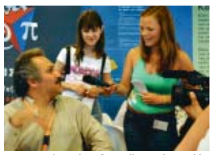
Young Filmmakers from all over the world met at the KidsForKids-Festival in Athens

In Athens, ten invited youngsters worked together on a festival video report, inspired by the Athens Olympics and guided by