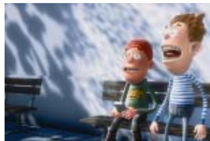
"Terkel in Trouble"

Feature Film, Netherlands 2004Director:Ben SombogardProduction:Bos Bros.Release:Winter 2004