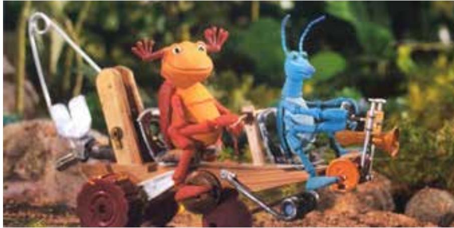
Tootletubs & Jyro