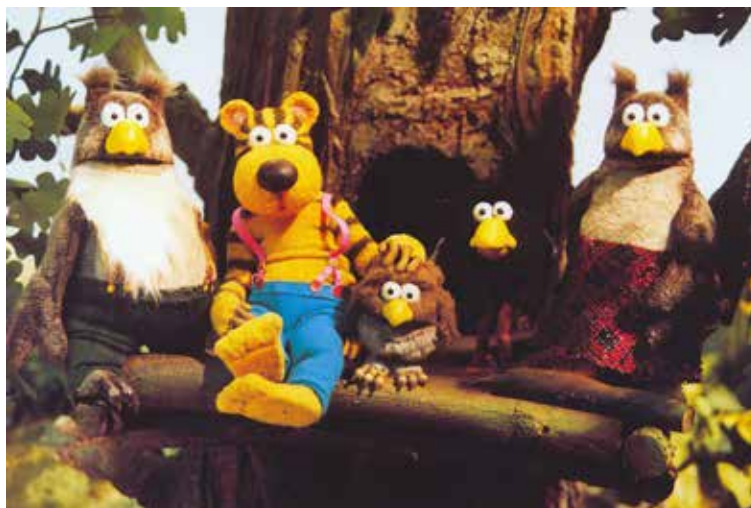
Les animaux fous fous fous

Often used as common thread are: same main character (Laban, Spot & Splodge, Tootletubs & Jyro,...), same country of origin (a fil rouge commonly used in France, for instance LES CONTES DE LA MERE POULE (Iran), LES ANIMAUX FOUS FOUS FOUS (Letvia), Slavic tales in L'OGRE DE LA TAIGA,...), and of course the same age group.