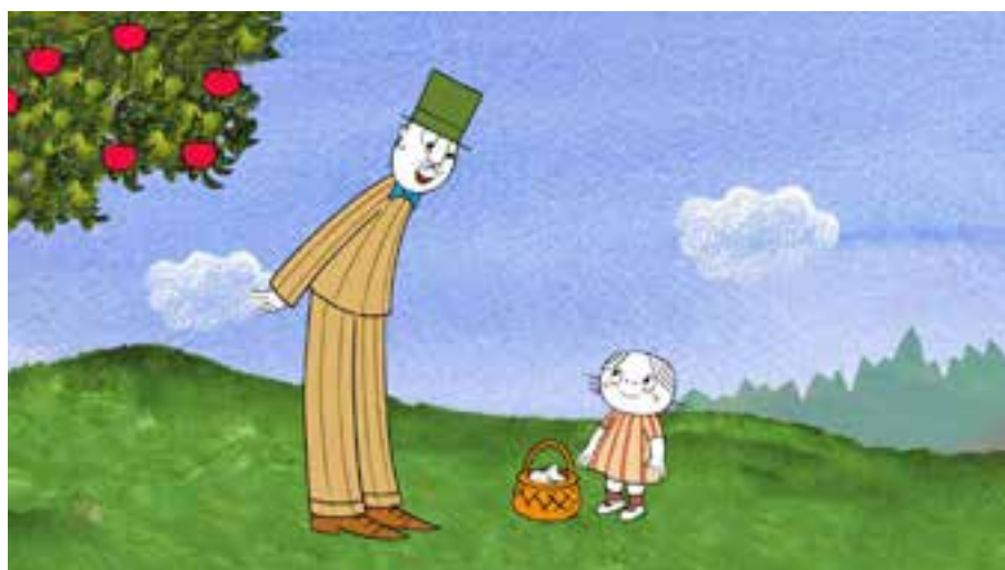
Little Anna & the tall uncle

Thanks to the cooperation of the ECFA members - film institutes, distributors, festivals and cultural organizations - we gained a better understanding of the situation in various European countries.