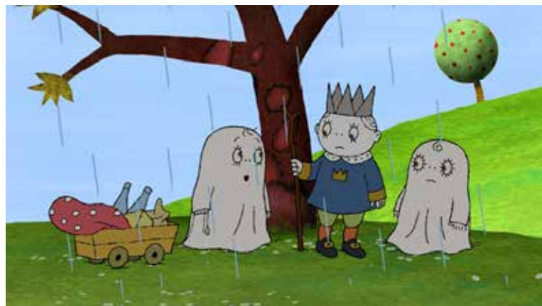
Laban the little ghost