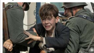
Secrets of War