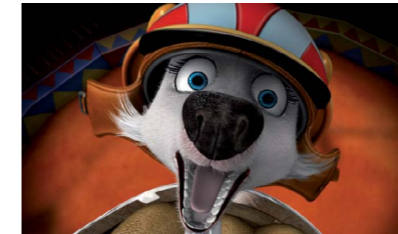
Belka and Strelka