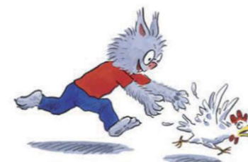
Alfie the little Werewolf