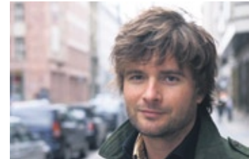
The Race (André F. Nebe)