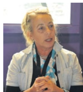
Sannette Naeyé © Gerlinde de Geus