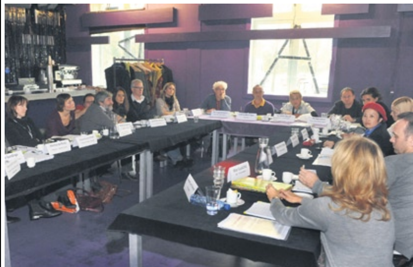
Cinekid meeting in Amsterdam

VOD (video on demand) is a relatively new method of offering films and TV-programs through online, cable and mobile distribution. VOD is interactive in a sense that it puts the viewer in the driver seat: the receiver decides what, where and when he/she will watch.