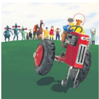
A Town called Panic