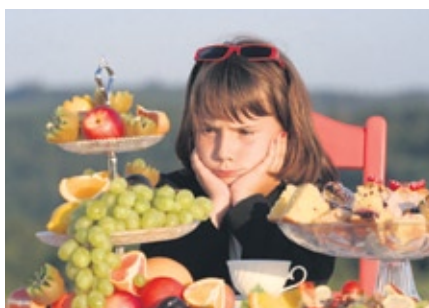
The Magic Tree